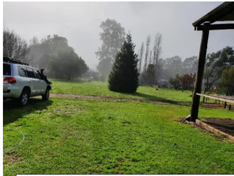
The fog still around at 10.15am but it made for a beautiful day when it lifted.